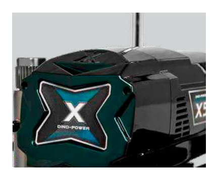
X Design Of Appearance/ Lacquered Outer Shell The flat, smooth and bright external surfaces and beautiful shape. Available on all X models.

Our mission is to fit you to the sprayer that is sized for the work you do to get the job done right, every time.