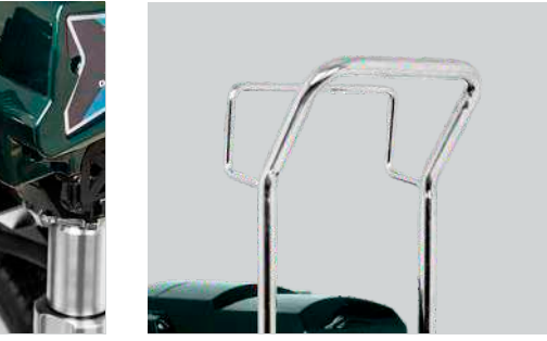
Chrome Plated Steel Tubing Enormously strong and tough Chromium plated for durability