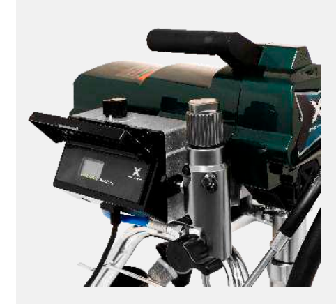
Full sized Mainfold Filter Easy maintenance and less clogging.

Constantly monitors performance and adjusts motor speed to match your tip size and spraying needs