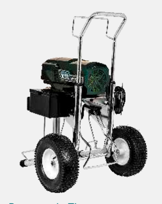
Large Pneumatic Tires

It's storage box for easy carry the accessories like the gun, tips, guards, filters, tools and lubricating oil etc