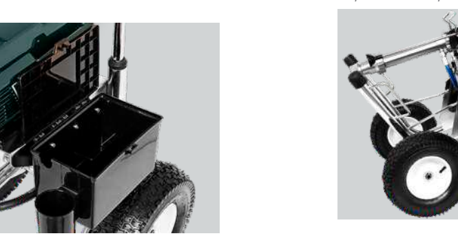
The Hanger For Side Lay The hanger is able to support the machine during reloading the material, and can also be used for hose reel during storage.