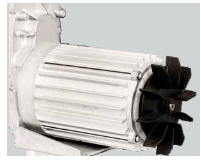
Brushless Motor The Brushless Motor never wears, No brushes or commutator to wear out. No sparking from carbon brush High torque, Low amp draw, Longer cords Available on models X24-81L T60/T85