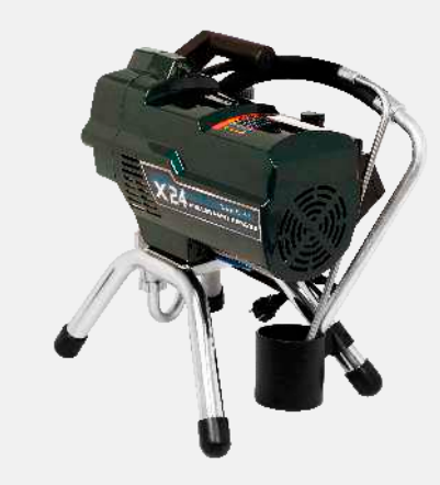
Lacquered Outer Shell

Compact design for ease of transport and space-saving storage Also available as High-Cart