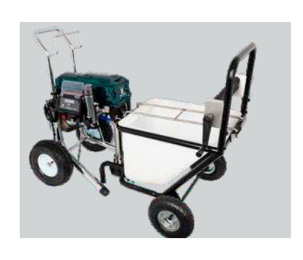
+ HC60 Material Hopper The 60L gravity feed hopper for high production painting and plastering applications.