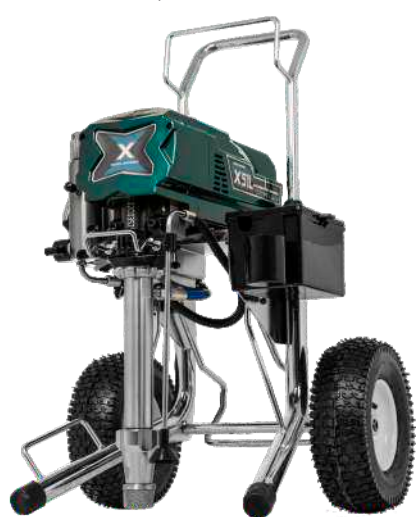
The HC-60 Material hopper is optional.