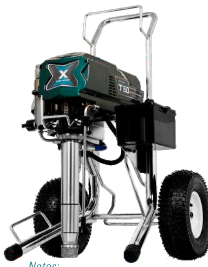
The HC-60 Material hopper is optional.