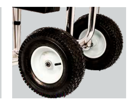
Pneumatic-Tyre For no-flat reliability. To absorb impact and add greater mobility on the job site.