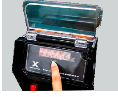
Electric Pressure Control The Microprocessor programmed to perform at maximum efficiency for each tip size ensuring a consistent spray pattern at all pressure settings. Available on models X24-81L, T60/T85